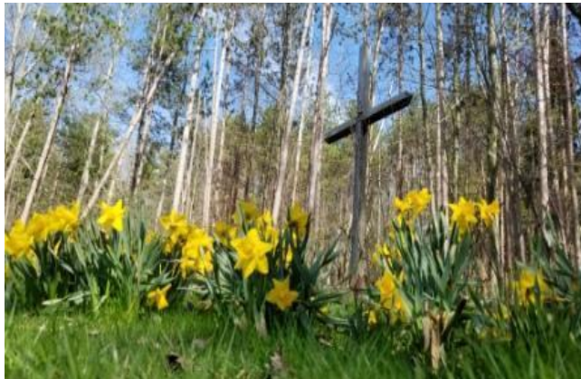
Since 1988, the large cross has stood as a reminder of Christ's love in St. Andrew's outdoor chapel.

Look for additional construction in the St. Francis outdoor chapel this month (we hope!) The large cross will be replaced due to extensive insect damage to the cross beam.