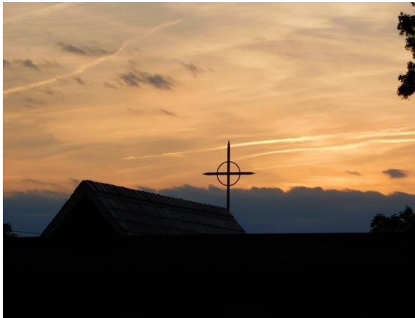
Sunset

Proceeds from our flower sale support St. Andrew ministries.