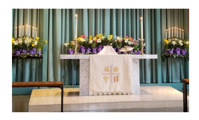
Thanks to our Flower Guild for their dedication to helping make the church beautiful!

On Tuesday, April 21st, CarePatrol will be at the church to present a free informative program on "Eldercare Options & How to Pay for Them" CarePatrol is the nation's largest Senior Placement organization helping families find safer care through assisted living, independent living, memory care, in-home care and nursing homes. the presentation is at 6:30 PM. All are welcome to attend and learn!