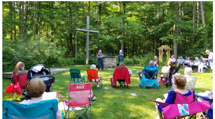
A Lector reads the scripture at an outdoor service.