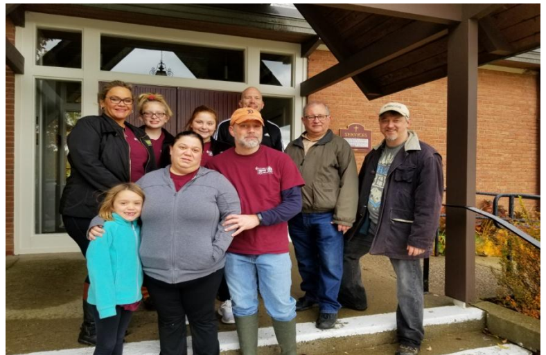
St. Gabriel & St. Andrew Window Washers from 2018. Note the bright shiny windows behind them!

Gabe's by volunteering to help on Saturday, November 9th from 10 AM to 1 PM. We'll wash windows both inside and out! A sign-up sheet is posted in the Narthex.