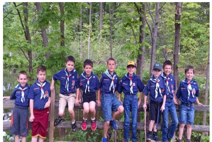
Scouts from Pack 79