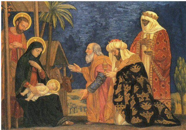
Adoration of the Magi 1915

We will hear it together, wherever we are, and our hearts will glow.